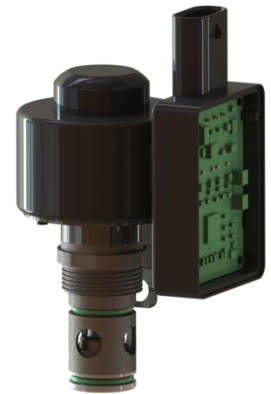
热泵空调系统电子膨胀阀 Heat Pump Air Conditioning System Electronic Expansion Valve